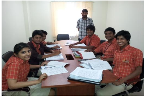
Students attending SAT classes